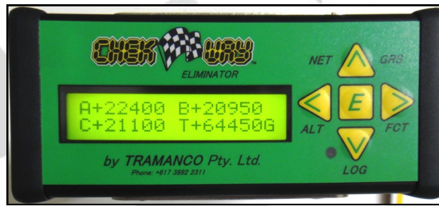
CHEK-WAY® Eliminator Display Unit As configured for a B-Double Truck and Trailers

Remember, The future in weighing is here now!